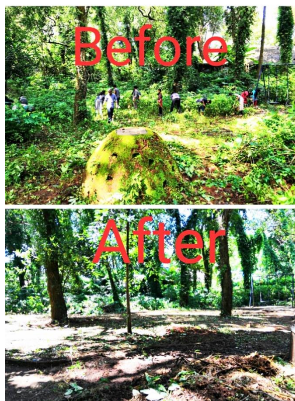
Cleaning at Kuthiravattam Mental Hospital