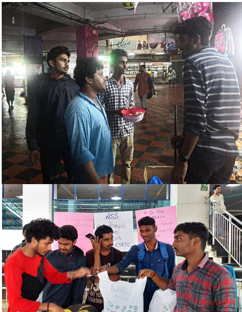
Collection Point at KSRTC Bus Stand