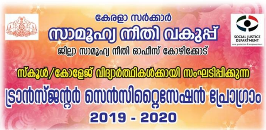
Posters on awareness campaign