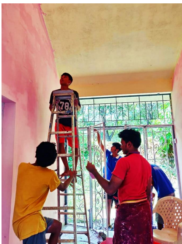
Painting at IPM

On 24-01-2020, Thondayad by-pass cleaning in collaboration with corporation.