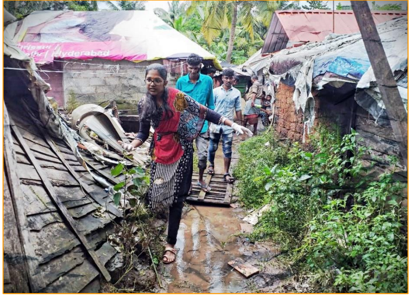
Kalluthan Kadavu Cleaning