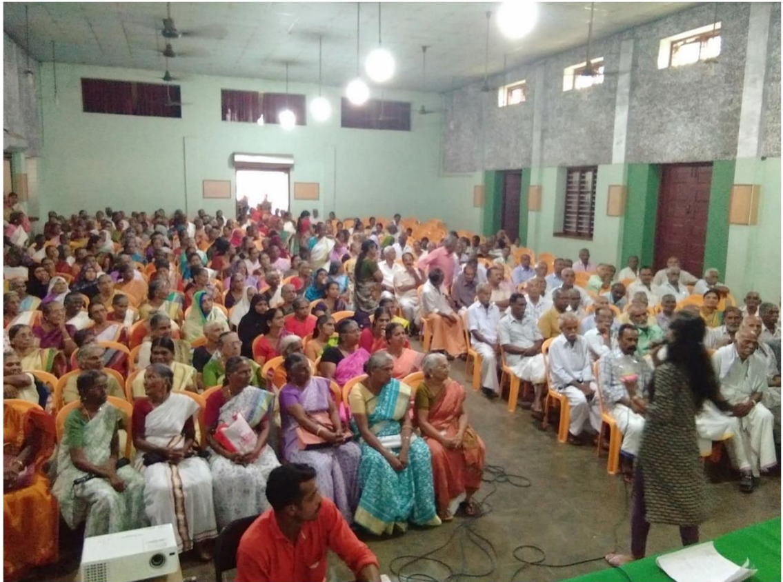
Celebration of International day for elderly at Meenangadi Grama Panchyat