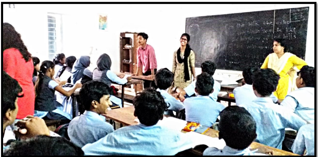
Poshan Abhiyan Azchavattam campaign