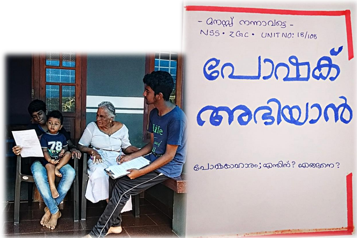
Poshan Abhiyan Pamphlet