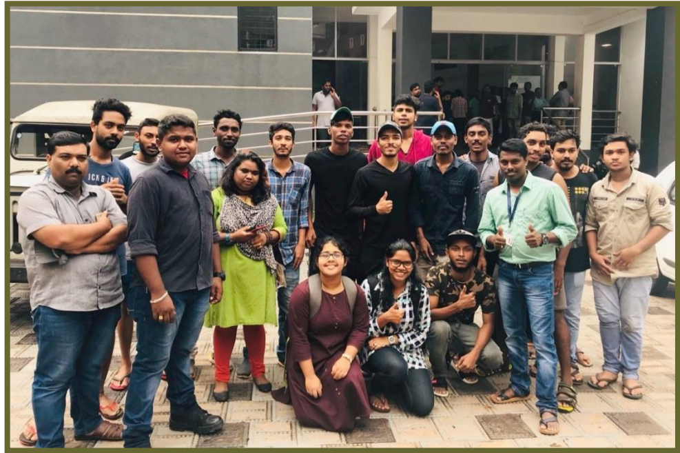
Collectorate Flood Relief Team