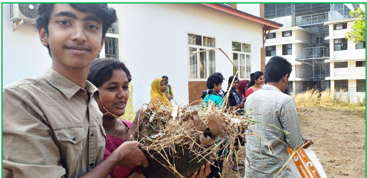
IPM carnival cleaning work