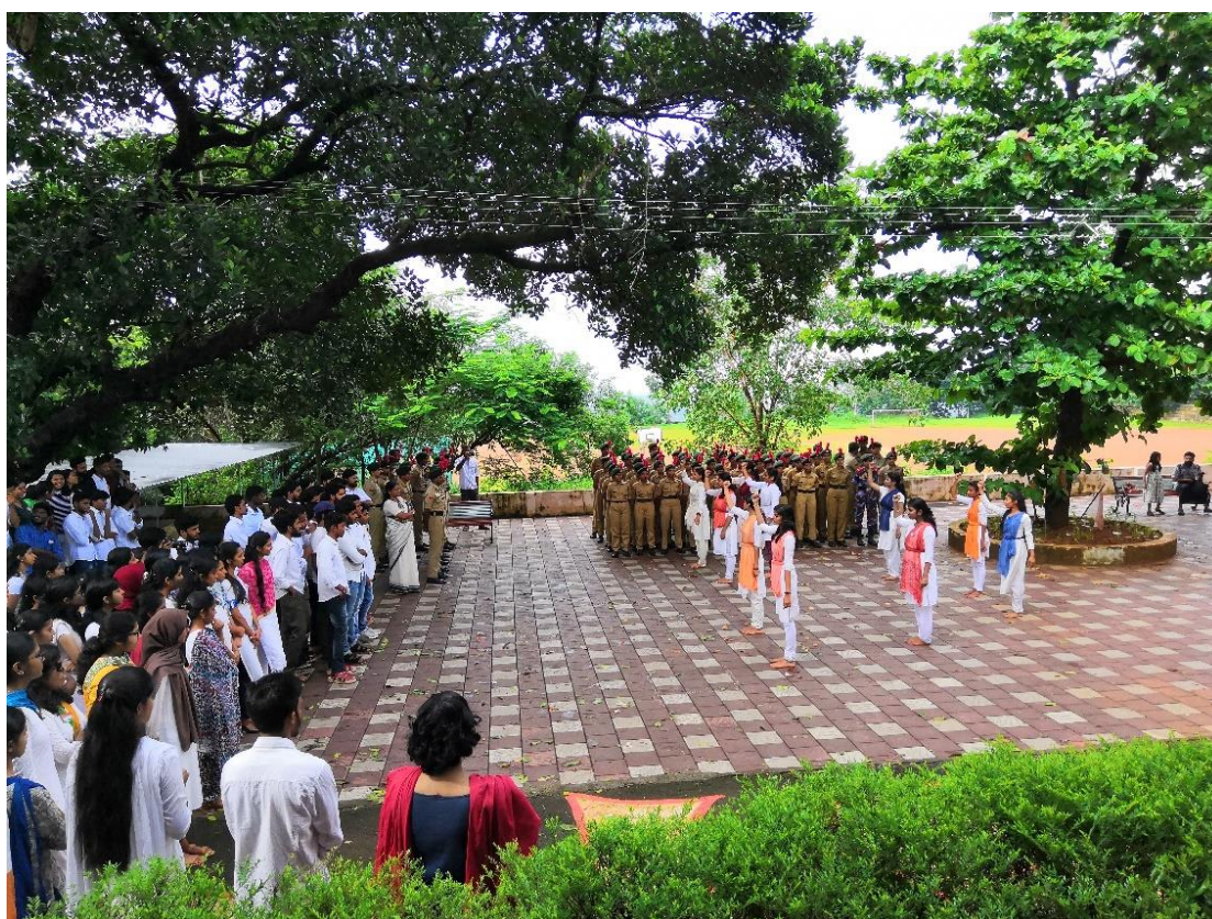
Independence Day celebration

On 26 th of January, 2020 Republic Day event was organized by NSS in the college premises. The National flag was hoisted.