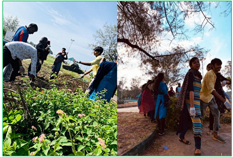
Kozhikode beach cleaning