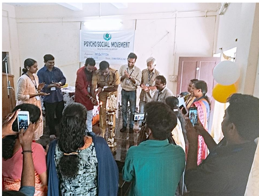
Disaster Management Training Programme

On 16-10-2019 two volunteers participated in disaster management & basic life support class in connection with international disaster risk reduction day.