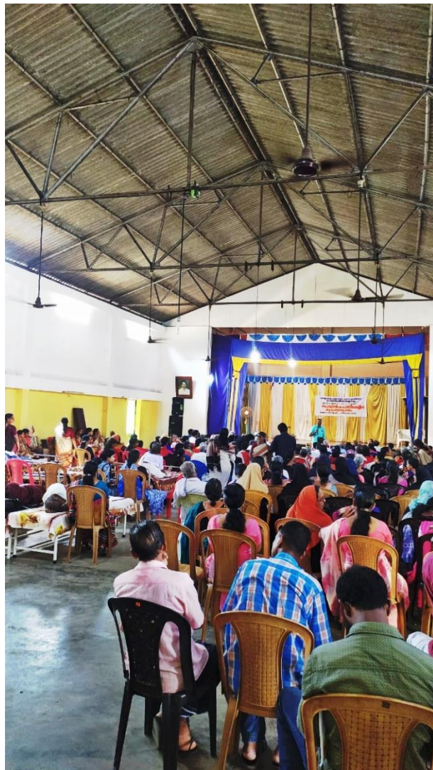
Pain and palliative care family get together inauguration at Olavanna Grama Panchayat

On 14-02-2020, participated as volunteers in the all Kerala management fest at ZGC.