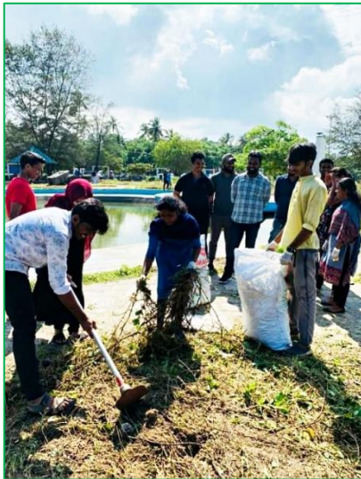
Butt road beach cleaning